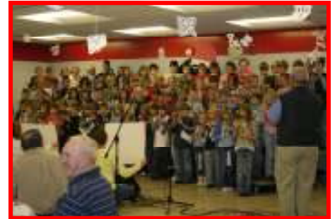
TCN 4th Graders