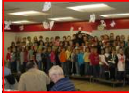
TCN 2nd Graders

After the entertainment, door prizes were given away to those in attendance. Door prizes were generously donated by the following businesses: Village Florist & Gift Shop, Miller's Hardware, Sarah's Pizza & Subs, Brennan's Grocery Store, Subway, Wendy's, Rob's, Dayton Dragons Organization, Loudy's Office Supply, K's Restaurant and The Specialty Shop. Thank you to everyone for your generosity and time!