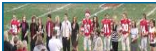
2010 Homecoming Court