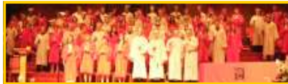
Class of 2009

The Tri-County North Board of Education, Administration and Staff would like to wish each graduating senior the very best in all of their future endeavors. It has been a pleasure having you represent TCN! Congratulations and best of luck to you!