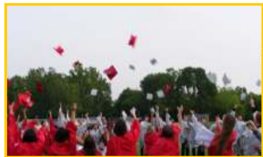
Hats off to the Class of 2009!

The 2009/2010 school year begins August 19th!