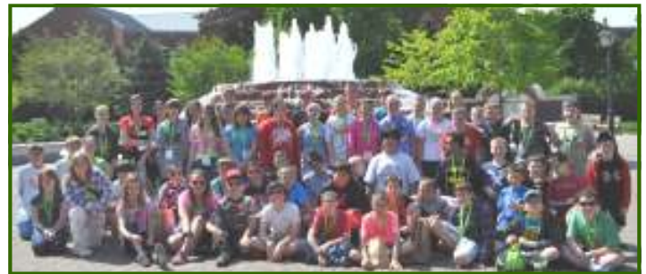
Above: 6th Grade in MI

become more successful every year. TCN staff members make the program function smoothly with their hard work and dedication. Next year will, no doubt, bring new students and mentors reading excellence!