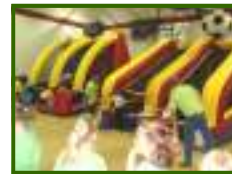
Right: Elementary Field Day