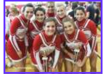
TCN Varsity Squad

Congratulations and best of luck to the TCN Varsity Cheerleading Squad!