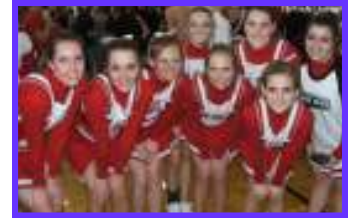
Junior Varsity Squad