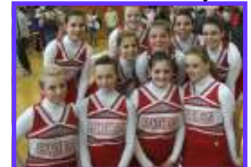
Junior High Squad

March 13th Winter Sports Banquet 6:30 P.M.