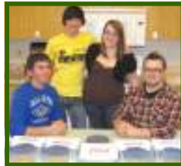
FCCLA Cares Project: TCN FCCLA has been planning, preparing and delivering healthy meals to older adults in the Lewisburg Community

The average person will spend two weeks over their lifetime waiting for traffic lights to change.