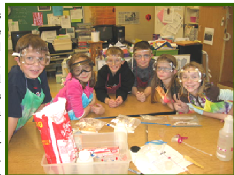
TCN 3rd Grade Students

Meca 4th graders staged an interactive science carnival for all 3rd grade classes. Booths featured “hands-on” activities such as domino chain reactions, electrical nerve testers, density goo tubes, light periscopes, and other physics toys.