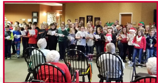
TCN 5th Graders sharing the holiday spirit through caroling for the residents of local nursing homes!